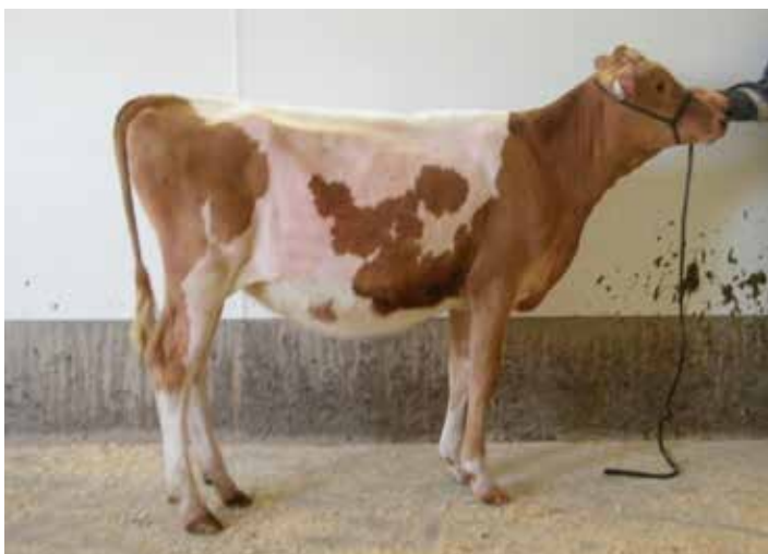
WINTERTHYME LM PEPPERMINT

Peppermint is a December 2019 daughter of Flambeau Manor Ladys Man from Winterthyme Ernie Cayenne VG87 sired by Paokie Lil Ernie.