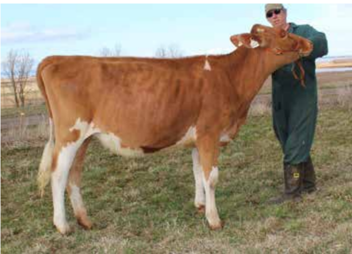
FULLER VIEW PILOT GELATO

This heifer was born in March 2019 and is sired by Lindrian Grumpy Pilot and from Guernsey View Beccas Denise who is sired by Jens Gold B Spruce Winslow.