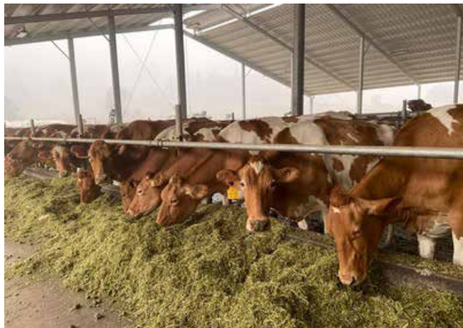
The Beachie Creek fire moved within 4 miles of the farm, making the air quality extremely poor. The smoke was thick and heavy for both the cows and people, but luckily the herd seemed to be little affected at the time.