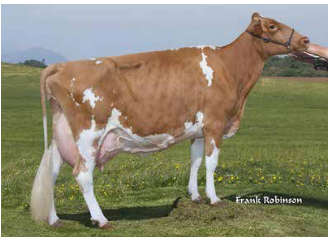
Abiqua Acres Presige Jesusita EX-92 exemplified Abiqua Acres’ breeding goals, producing over 180,000 and living to be 17-years-old.