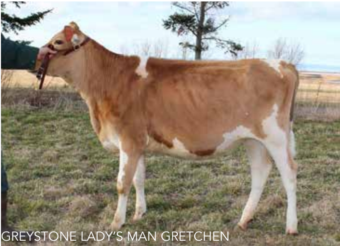
GREYSTONE LADY'S MAN GRETCHEN

6600 kgs milk, 380 kgs fat at 5.8% fat at 2-0